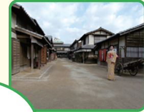
Edo street open movie set