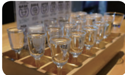
Fushimi Sake Village (Fushimi Saka Gura Kouji)

Tour breweries and shops lining one of Japan's foremost sake areas, Fushimi, and along the way pay a visit to Gokonomiya Shrine, renowned for its water.